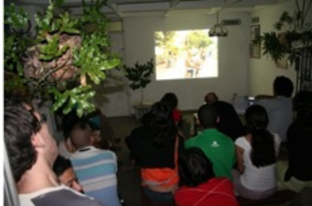
Projecting "Cuba Performance" at our house